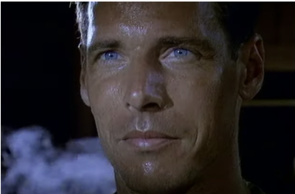
Einstellung Nr. 14 (reverse shot)